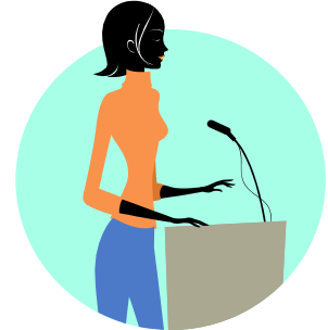
You too can become a presenter for POTA!

This newsletter, the Penn Point and OT Practice all welcome submissions, just check out the publication for the editor contact info or go to the POTA or AOTA websites.